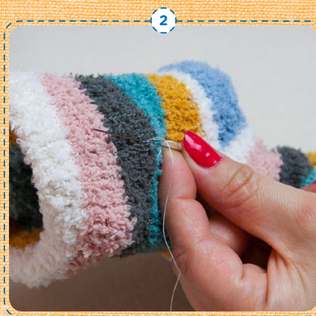
Using a hand-sewing needle and thread stitch the corners of snake's mouth so the shape is secure.