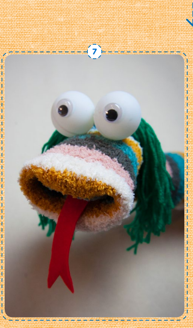
Stick your snakes googly eyes on to the ping pong balls. Most have a sticky back, but if not use some glue.