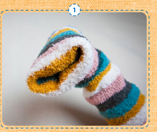
Start by creating your snake's mouth. Put your hand into the sock and tuck the toe of the sock inwards.

Read through the instructions carefully and gather all of the materials needed before you start.